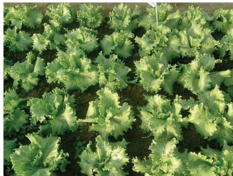
Figure 1. View with variety Great Lakes 118

Under climatic conditions of the year 2012, the culture has been established by planting of seedling on 15 th of October. The seedling was by 28 days old and 5-6 leaves.