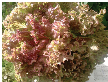
Figure 4. View with variety Lollo rossa