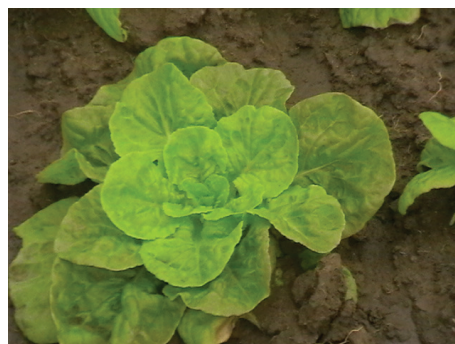
Figure 3. View with variety May King

differences for Folimax treatment, variety May King give best results at Agriphyte treatment (Table 6, Figure 3 and 4).