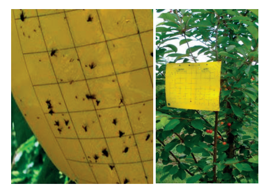
Figure 1. Glue traps

Scouting for diseases and pests attack has a particular importance in fruit tree species to establishing the attack value during the vegetation season.