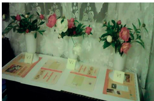
Picture 10. Aspect of flowers kept in vases, blooming of flowers, variants V1-V3, May 2019