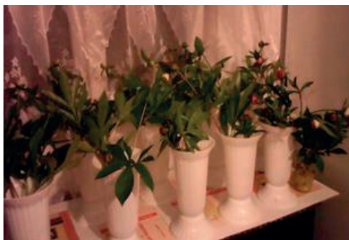
Picture 2. Aspect of flowers belonging to some cultivars of herbaceous peonies, at the moment of their introduction into vases with different solutions, 2019