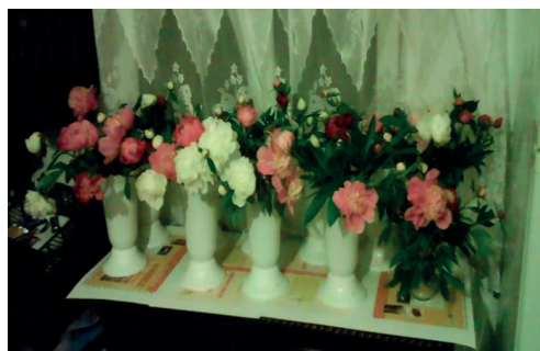
Picture 12. Aspect of flowers kept in vases, complete blooming of flowers, variants V1-V11, May 2019