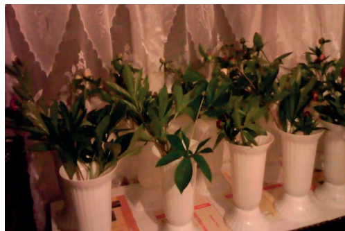
Picture 1. Aspect of the cut flowers at the moment of flowers' introductions into the vases with solutions belonging to some herbaceous peony cultivars, May 2019

The research material used, as well as the studied characteristics of the cultivators' flowers are represented in Table 2.