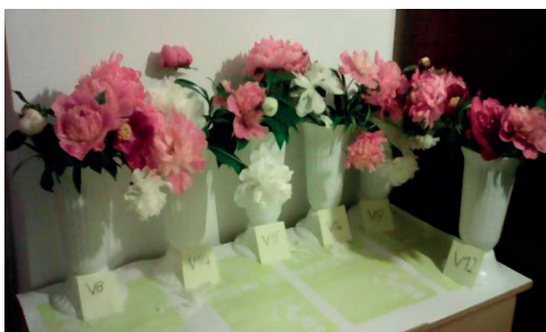
Picture 14. Aspect of blooming in vases, flower complete blooming, V12-V17, May 2019