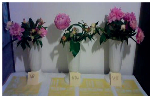
Picture 16 Aspect of flowers, blooming end and petal falling, May 2019