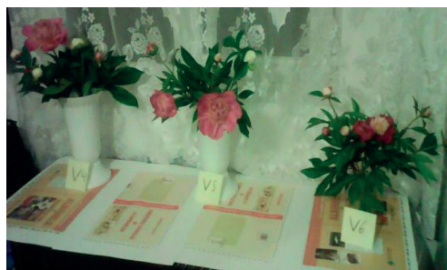
Picture 11. Aspect of flowers in vases, blooming of flowers, variants V3-V6, May 2019