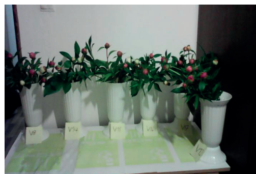
Picture 4. Aspect of cut herbaceous peonies at their introduction into vases with different solutions, 2019