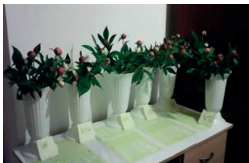
Picture 3. Aspect of buds belonging to some cultivars of herbaceous peonies, at the moment of their introduction into different solutions, 2019