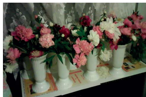
Picture 13. Aspect of flowers kept in vases, flower complete blooming, V1-V11, May 2019