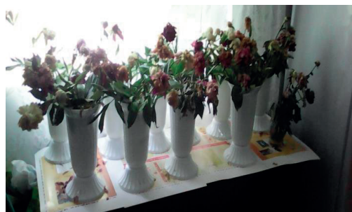
Picture 18. Blooming end and petal falling, May 2019