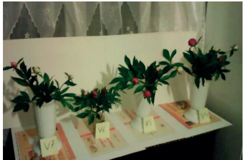
Picture 6. Aspect of flowers kept in vases with different solutions, variants V4-V7, 2019