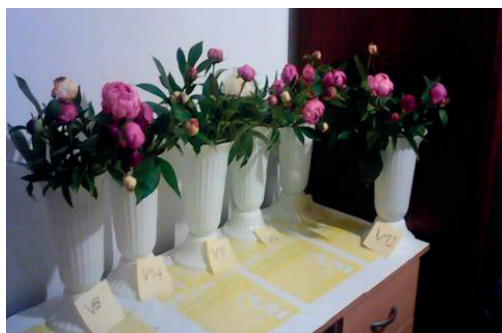
Picture 8. Aspect of flowers in vases, blooming of flowers, variants V12-V17, May 2019

Observing the data in Picture 9 on lifetime of the flowers kept in vases with different solutions, it results a minimum lifetime period between 5 day for cultivar Festiva maxima, and a period of 8 days for the cultivars Pink Giant and Celebrity, as well as a lifetime period of the flowers between 8 days for the variant Celebrity and 11 days for the cultivars Festiva maxima, Dorren and Pink Giant