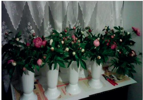
Picture 7. Aspect of flowers kept in vases, blooming of flowers, variants V1-V11, May 2019