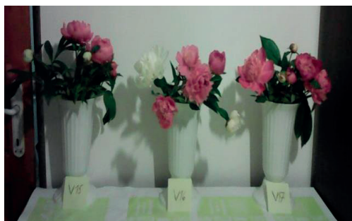
Picture 15. Aspect in blooming in vases, complete flower blooming, variants V15-V17, May 2019