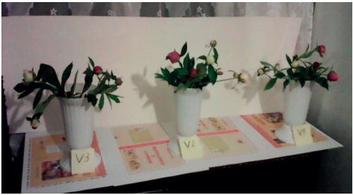
Picture 5. Aspect of flowers kept in vases with different solution, variants V1-V3, May 2019