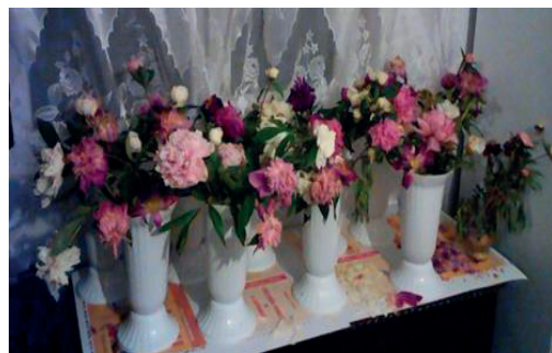
Picture 17. Aspect of flowers in vases, blooming end and petal fallings, May 2019